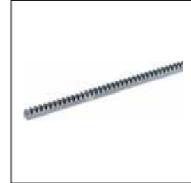
M6 galvanized rack (30x30x2000 mm) (needs the RI.P6 accessory to work)