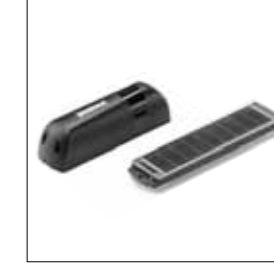
868 Mhz radiofrequency device comprising: 1 battery-operated device recharged by means of a photovoltaic panel applied on a mobile edge, with input for connection to an 8K2 sensitive edge or to a mechanical door switch. Technical features on page 214