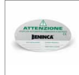
Aluminium warning board Available in different languages