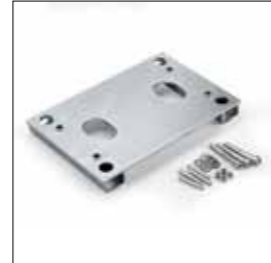
Raised foundation plate included 280 x 170, n.4 Ø 11 floor brackets, 269 x 106 n.4 M10 screws for motor