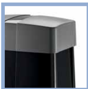
Functional design. Shape to convey all the strength and reliability of the motor

BULL20M supplied with control unit and integrated receiver BULL20T without control panel