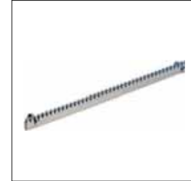
M4 galvanized rack with slots and screws (30x12x1000 mm) Packaging: 4 pcs