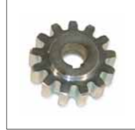
M6 gear, It needs the rack RI.M6Z