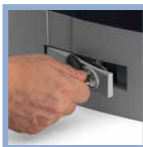
Sturdy key-operated personalized unlocking system