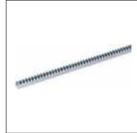
M4 galvanized rack (22x22x2000 mm) Packaging: 2 pcs