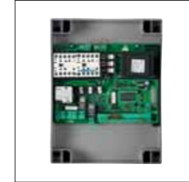
Control panel suitable for one 230Vac single phase operator up to 1500W or 400Vac 3-phases operator up to 2.200W. Built-in display for programming the functions. It is prepared with a plug-in connection for radio receiver. Technical features on page 158